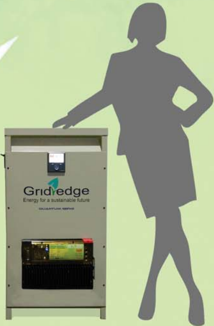
QUANTUM "plug and play"