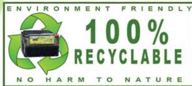
The only battery that is 100% recyclable